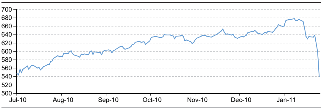
Chart 3 Hermes Stock Market Index

Financial variables have received a significant correction: The National Stock Exchange (Hermes) lost 20% from January 10th to 27th, and it has remained closed afterwards. The CDS has also been severely penalized, with a maximum increment of 250 bps on January 28th, later sustaining lower increments. The Egyptian pound has not endured such a drastic correction, around 2%, partly because it is tightly managed by the Central Bank, and especially because of market activity has been severely restrained since the turmoil began.