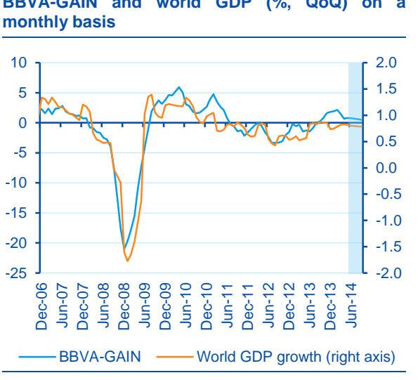
Figure 1 BBVA-GAIN and world GDP (%, QoQ) on a monthly basis

To wrap up, the global cycle holds at firm expansion rates, indicating more upside news are tentatively underway. Nonetheless, although currently more balanced, there are still some global risks that may drag the business cycle down, such as a tighter than needed monetary policy on the part of the Fed, struggling growth of the global demand stemming from economic slowdown in China or geopolitical risks derived from Eastern Europe.