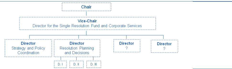
Figure 2 Single Resolution Board