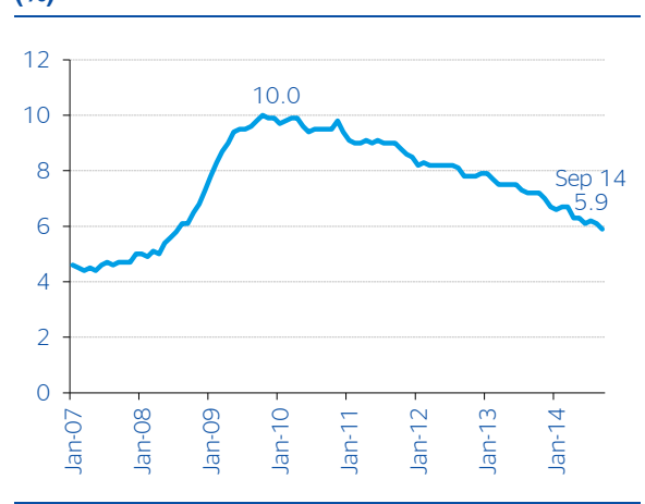
Chart 3 U.S.: Average unemployment rate (%)