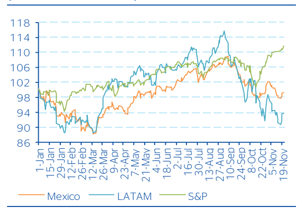
Figure 3 MSCI stock market indices (Index 1 Jan 2014=100)