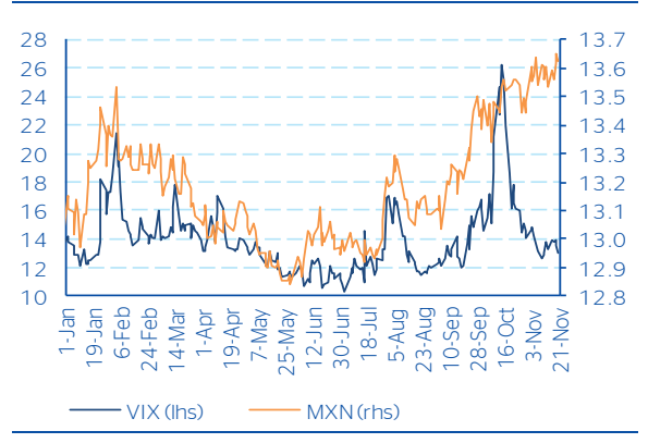
Figure 5 Global risk and exchange rate (VIX index and USDMXN)