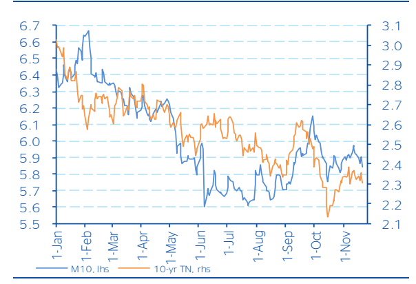
Figure 4 10-year government bond yields (%)