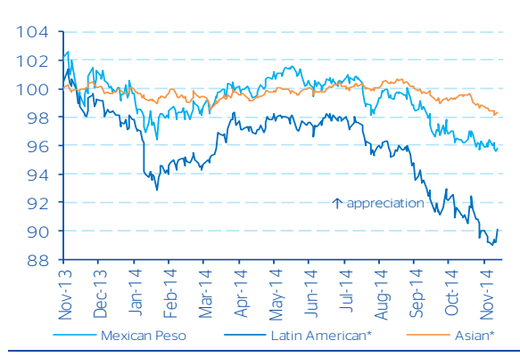
Figure 6 Currencies vs. USD (22 Nov 2013 index=100)

* JP Morgan indices of Latin American and Asian currencies vs. USD; weighted averages by trade & liquidity.