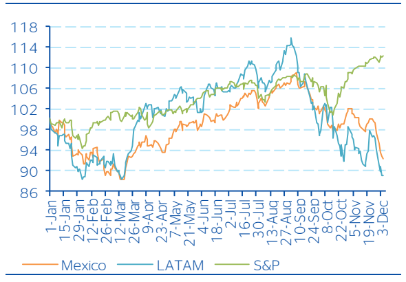
Figure 3 MSCI stock market indices (Index 1 Jan 2014=100)