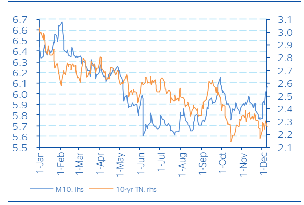
Figure 4 10-year government bond yields (%)