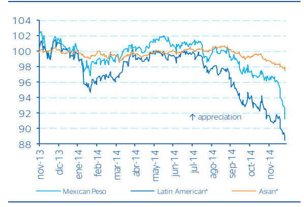
Figure 6 Currencies vs. USD (22 Nov 2013 index=100)

* JP Morgan indices of Latin American and Asian currencies vs. USD; weighted averages by trade & liquidity.