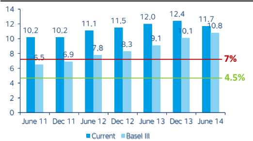
Chart 3 Group 2 Capital CET1 ratio (%)