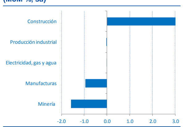
Figure 1 Mexico's Industrial production and its components in March (MoM %, sa)

Source: BBVA Research with INEGI data; sa = seasonally adjusted.