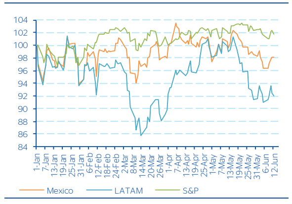
Figure 3 MSCI stock market indices (Index 1 Jan 2015=100)