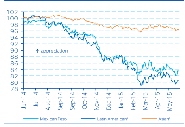
Figure 6 Currencies vs. USD (12 Jun 2014 index=100)

* JP Morgan indices of Latin American and Asian currencies vs. USD; weighted averages by trade & liquidity.