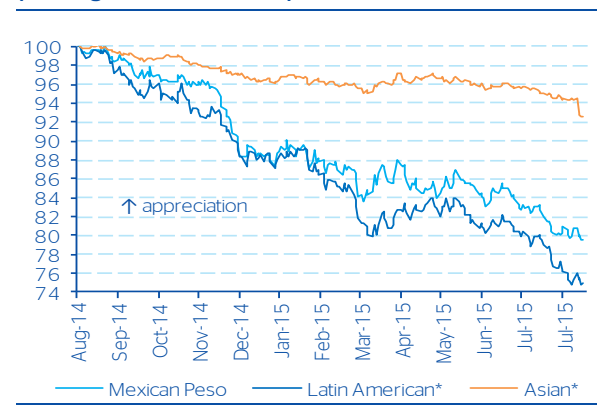
Figure 6 Currencies vs. USD (18 Aug 2014 index=100)

* JP Morgan indices of Latin American and Asian currencies vs. USD; weighted averages by trade & liquidity.