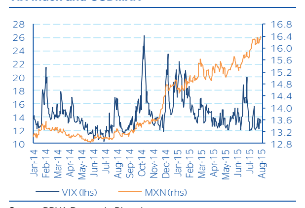
Figure 5 Global risk and exchange rate: VIX index and USDMXN