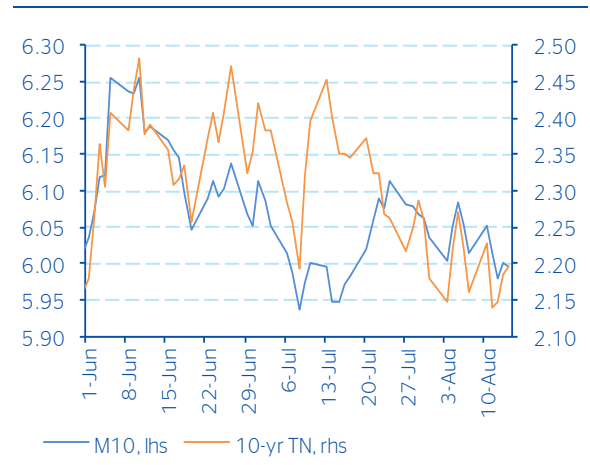
Figure 2 10-year government bond yields (%)