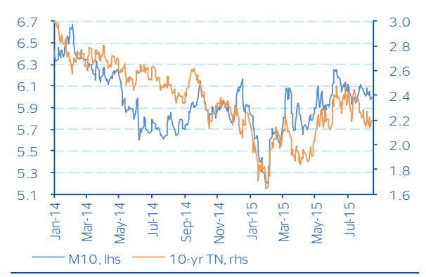
Figure 4 10-year government bond yields (%)