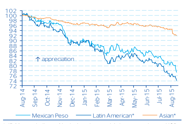
Figure 6 Currencies vs. USD (24 Aug 2014 index=100)