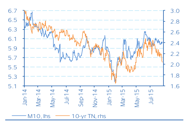
Figure 4 10-year government bond yields (%)