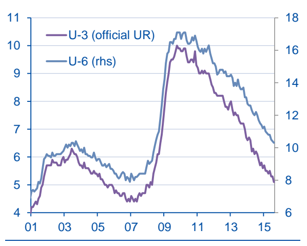
Chart 2 Unemployment Rate (%)