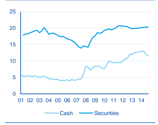
Chart 7 Cash & Securities on Balance Sheet (% of Total Assets)