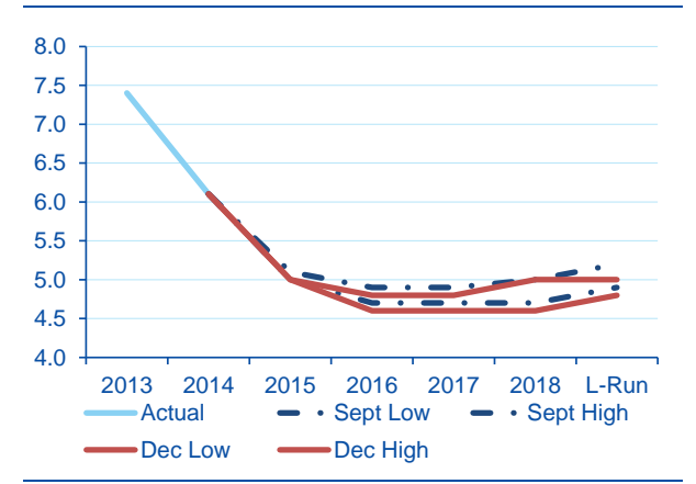
Chart 1 Unemployment Rate, 4Q % (Central Tendency)

In general, FOMC participants felt that economic conditions for liftoff had been met. Most notably, the Committee confirmed their prior assessment that "underutilization of labor resources had diminished appreciably since early in the year." This, along with long-run inflation expectations remaining stable, convinced the FOMC to a point that "nearly all participants were now reasonably confident that inflation would move back to 2 percent over the medium term." Still, some members expressed concerns on inflation, including the renewed downward pressures on oil prices as well as the ongoing impact of the strong USD appreciation. This may not have been enough to stop the first rate hike but will certainly play a role in the discussion surrounding any rate increases in the coming year.