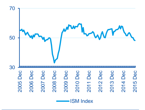
Chart 1 ISM Manufacturing Index SA, 50+ = Expansion

Plunging energy prices have been providing an extra boost to the economy since mid-2014 by raising consumers' disposable income and encouraging automobile purchases. Yet with oil prices likely reaching bottom in this year, weakening indicators on the supply side signal concerns over the U.S. economy in 2016.