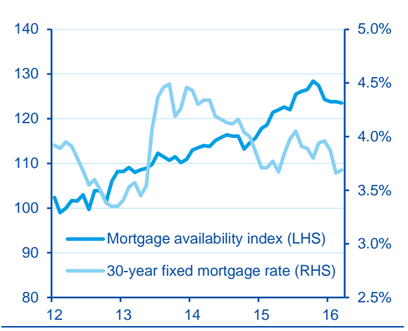
Chart 2 Mortgage availability and interest rates (Index and %)