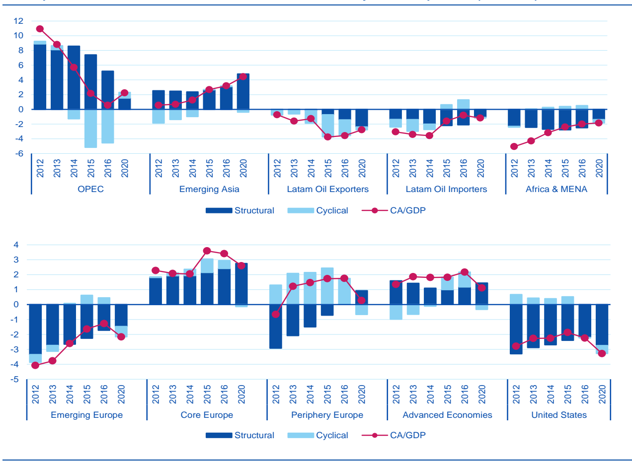
Figure 2 Decomposition of current account balance into structural and cyclical components (% of GDP)

Interestingly, our model-based Inter-Regional comparison of current account dynamics yields relevant idiosyncratic inferences for EM Asia (See Figure - 2). First, EM Asia will be the key winner from the new oil paradigm. If the oil prices do not recover more than expected<sup>2</sup>, Emerging Asia will replace even the OPEC as the main structural BoP surplus region in the emerging market arena by 2020. In fact, only the Developed