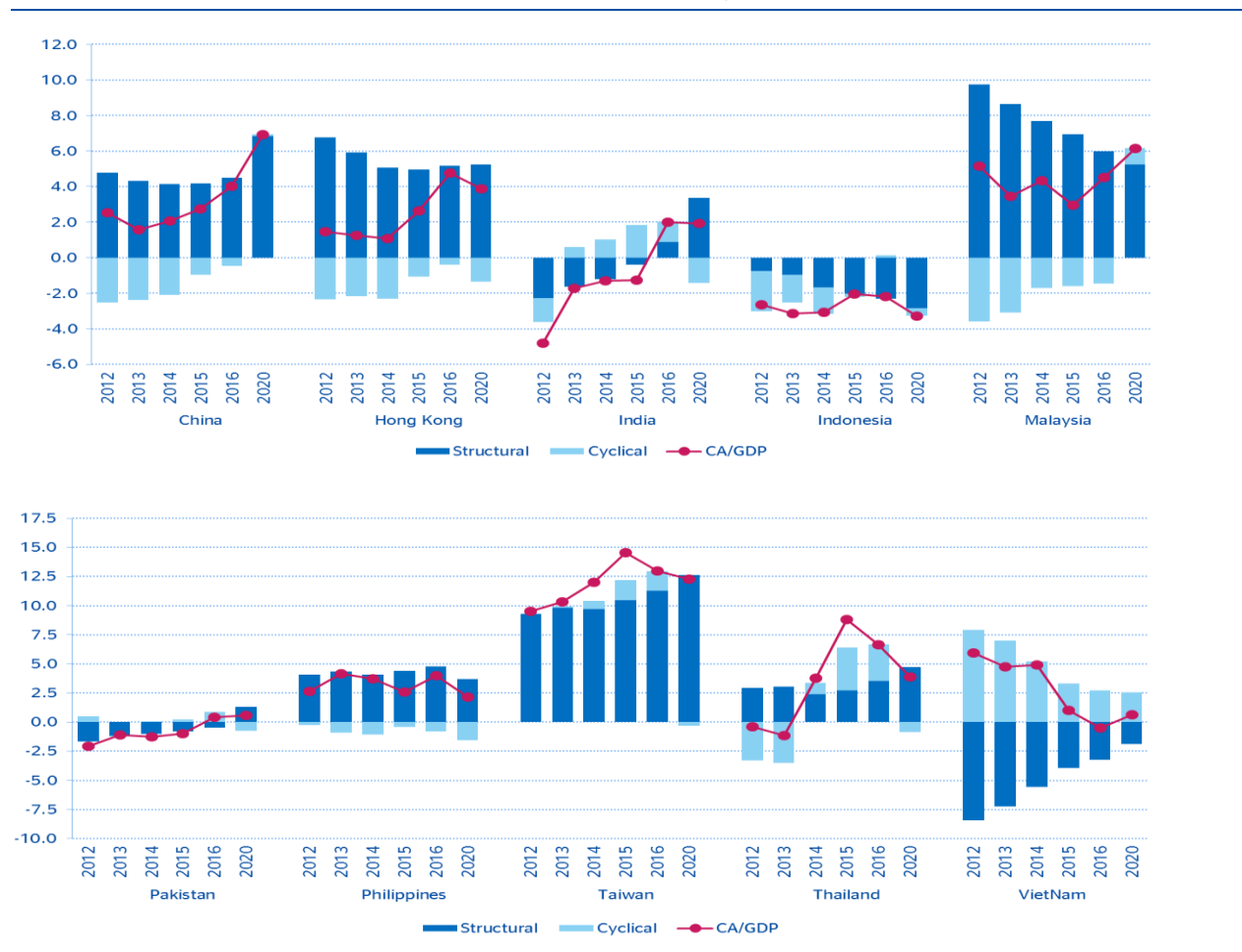
Figure 3 Decomposition of current account balance into structural and cyclical components (% of GDP)

Western Central European countries' CAB would remain slightly above these structural surplus levels. Second, low oil prices will be one, but not the only factor, driving EM Asia's structural CAB surpluses in the medium to long term. In fact, as we will discuss in the latter half of this watch, EM Asia's structural CAB will uniquely benefit from several savings determinants and investment imperatives, apart from the oil price impact. This significant structural improvement in external balances would act as an important buffer against potential external vulnerability risks for emerging Asia, in turn augmenting the region's sovereign credit profile.