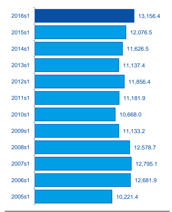
Figure 2 Remittances to Mexico in the first half of the year (Millions of dollars)