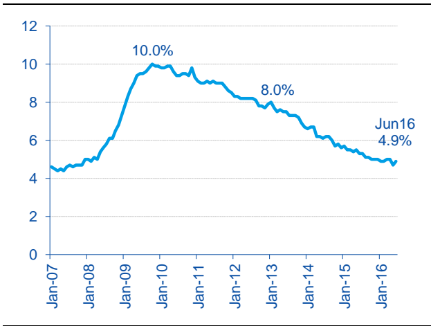
Figure 3 United States: National unemployment rate (%)

Source: BBVA Research based on figures from the US Bureau of Labor Statistics.