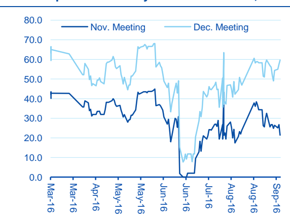
Market Implied Probability of Rate Increases, %