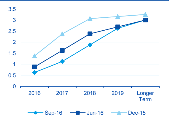
Chart 3 Median Projection of Federal Funds Rate

Nevertheless, markets took the news in stride with only modest changes after the announcement and press conference. The ho-hum response is no surprise given that consensus had shifted in the run-up to meeting. Post-meeting, markets continue to align with our baseline for one 25bp rate increase in December. Going forward, more optimistic sentiment about the current strength of the economy will leave the doves little room to maneuver out of hikes in 2016. Even the most dovish members will have a hard time convincing markets and other members that the pace of job growth seen over the last quarter is not sufficient enough to remove any remaining slack and that delaying rate hikes would be anything other than throwing good money after bad.