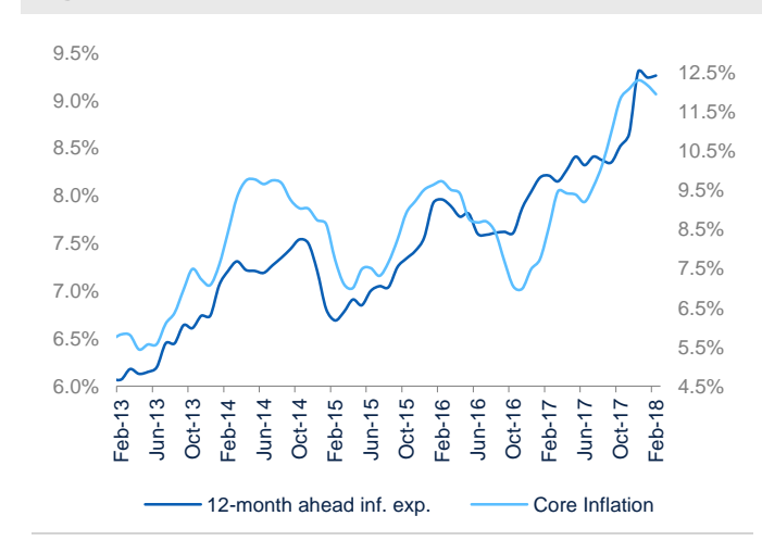
Figure 1 12-month Inflation Expectation & Core Inflation

Despite relatively stable levels of Turkish Lira against US dollar, globally appreciated Euro keeps currency basket depreciating, which results in a much more limited recovery in core inflation on base effects. Still strong domestic demand, second round price effects and high levels of inflation expectations also reinforce the inertia. Hence, we expect inflation to remain high during the year close to 10% until the last two months of the year when it will converge to 9% on base effects. Though, core inflation outlook stays more worrying as it may stay above 11% in the first half of the year, before falling below 10% in the last quarter. The CBRT stresses the rigidity in inflation outlook and its potential impact on pricing behavior and the policy tone remains tight, observed in our Big-Data sentiment (Figure 2).