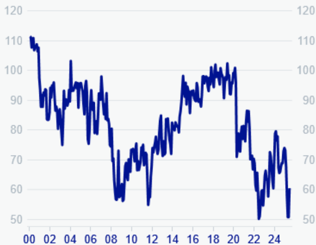
FIGURE 1. UoM CONSUMER SENTIMENT INDEX (PRELIMINARY, FEB.-1966=100)