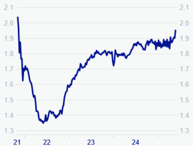
FIGURE 4. CONTINUING JOBLESS CLAIMS (MILLIONS)