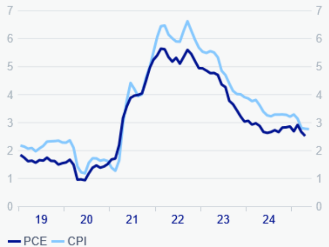
FIGURE 2. CORE INFLATION (%)