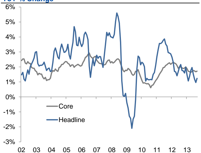
Consumer Price Inflation YoY % Change