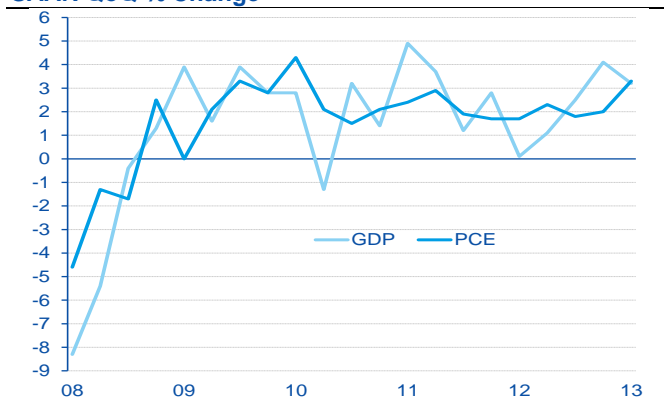
U.S. Real GDP and Personal Consumption Expenditures SAAR QoQ % Change