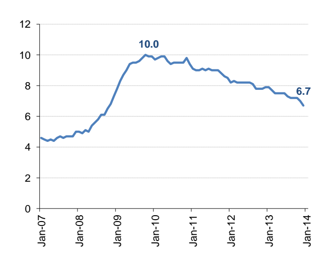
Chart 4 U.S.: Average unemployment rate (%)

Note: Seasonally Adjusted