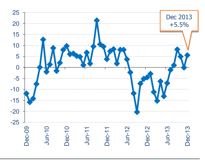
Chart 2 Family Remittances to Mexico (Annual % change in dollars)