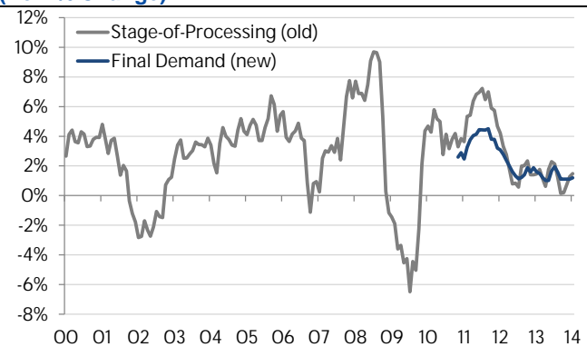
Stage-of-Processing (old) and Final Demand (new) PPI (YoY % Change)