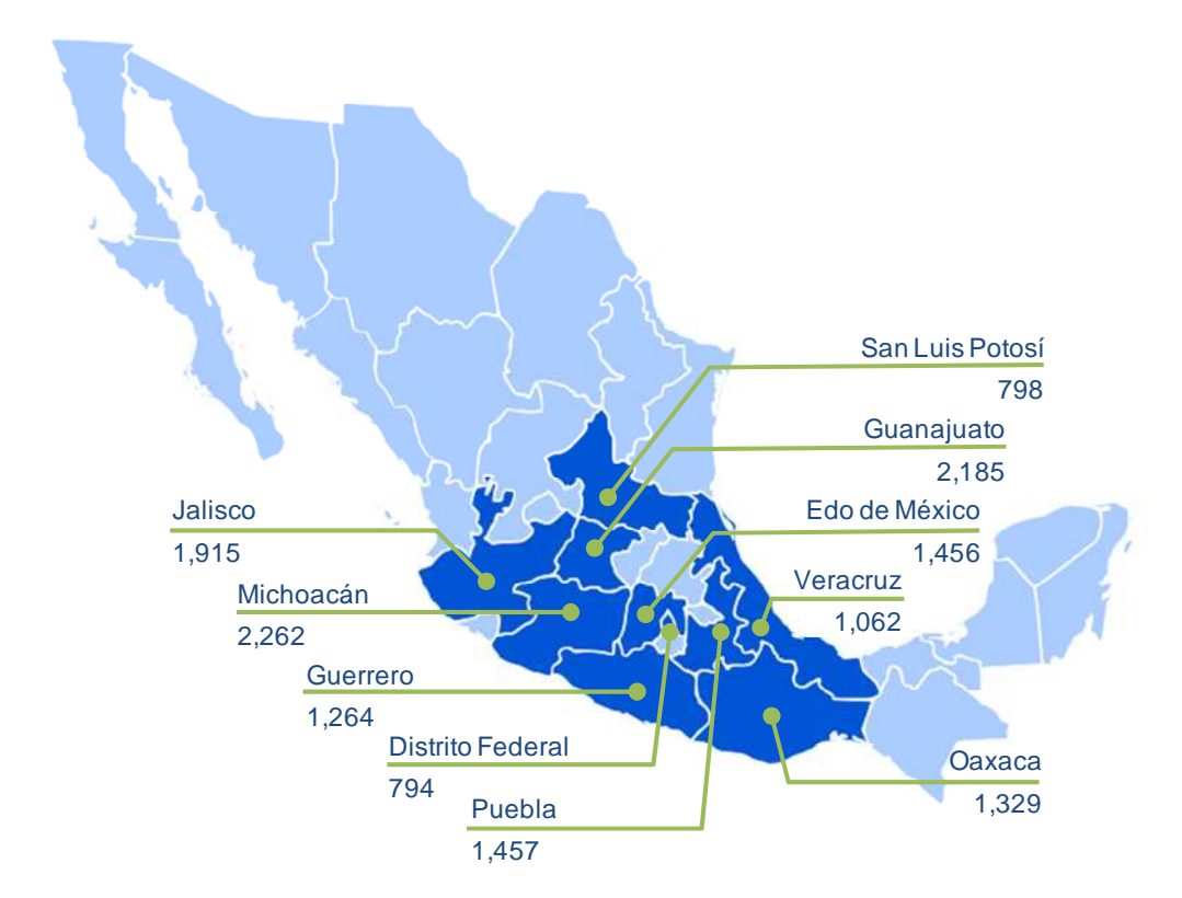
Chart 2 Top 10 states that could have the highest annual accumulated remittance flows in 2014e (Million dollars)