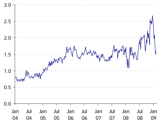
30-year Mortgage Interest Rate Spread (%)