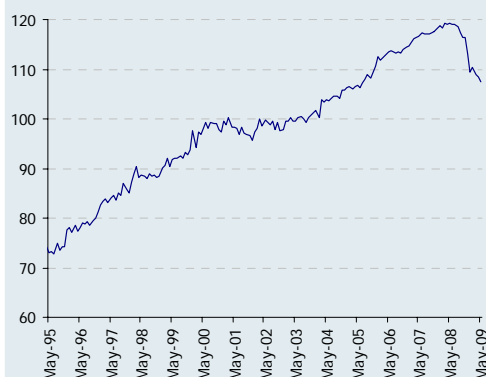
IGAE (2003=100, SA)