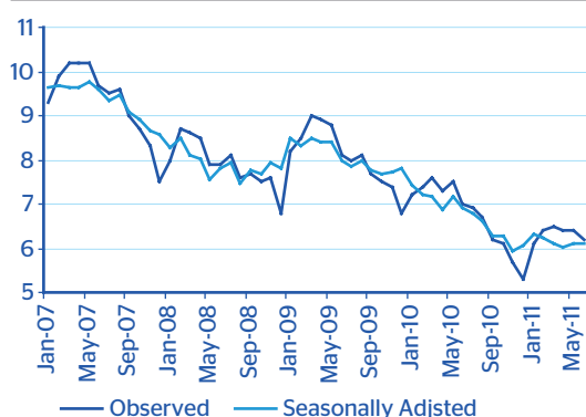
Chart 1 Unemployment rate (%)